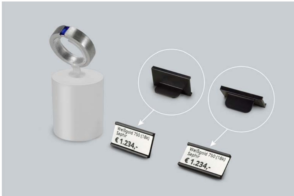
Img.3: Label holders of eXtra4 can be set up in two positions with the integrated stand: steep (70°) for decoration at eye level and inclined (40°) for comfortable reading from above