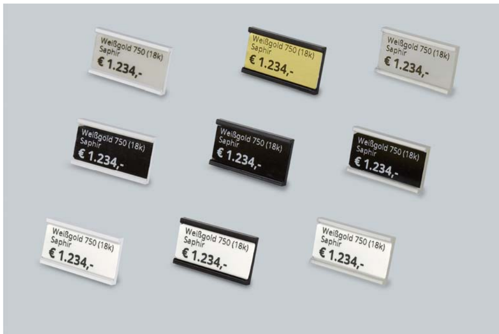
Img.5: Optical effect of white, black and transparent label holder 86 EH2 with differently printed labels in different colours