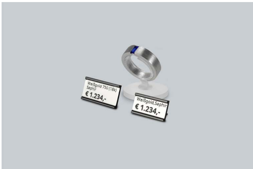
Img.4: Size comparison Label Holder 86 EH1-S for labels with labelling areas 18 x 8 mm (WxH) e.g. for label with loop 34 870IR and label for thread 34 835IR (right), Label Holder 86 EH2-S for labels with labelling areas 22 x 10 mm (WxH) e.g. for label with loop 44 1072 and label for thread 34 1044