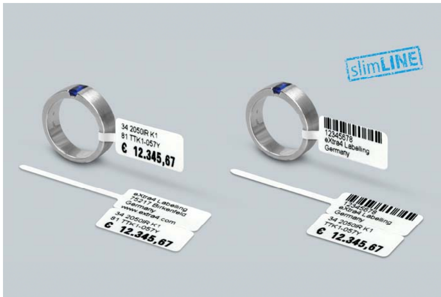
Fig. 3: Printing image of the "slimLINE" printer Godex RT200 with 200 dpi on "slimLINE" jewellery labels with loop, type 34 2050IR K1