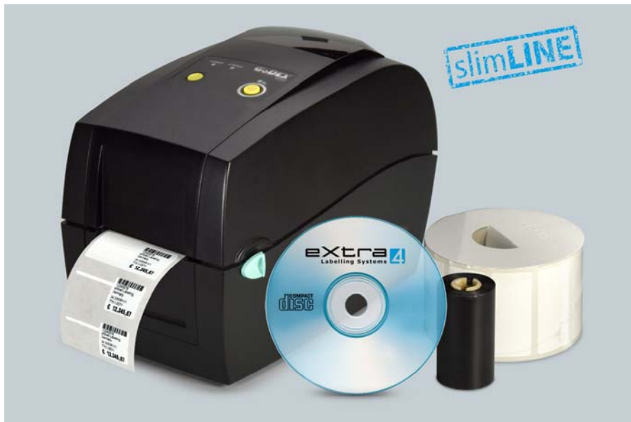
Fig. 6: "slimLINE" starter package with Godex RT200 label printer, extra4 label printing software, jewellery labels and colour ink ribbon