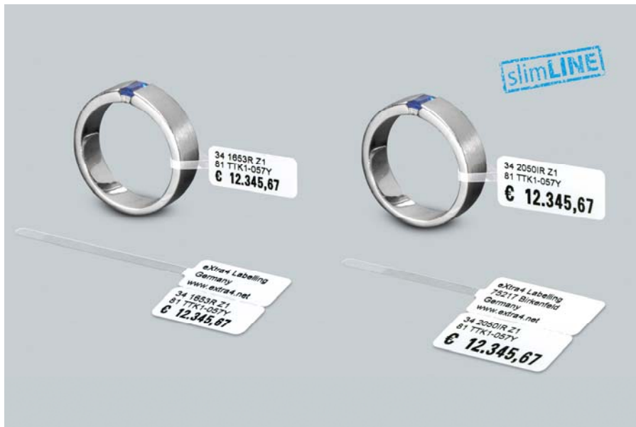
Fig.5: "slimLINE" jewellery labels with transparent loop in the sizes, small item No. 34 1653R Z1 and standard item No. 34 2050IR Z1, printing image of the "slimLINE" Godex RT230 printer with 300 dpi.