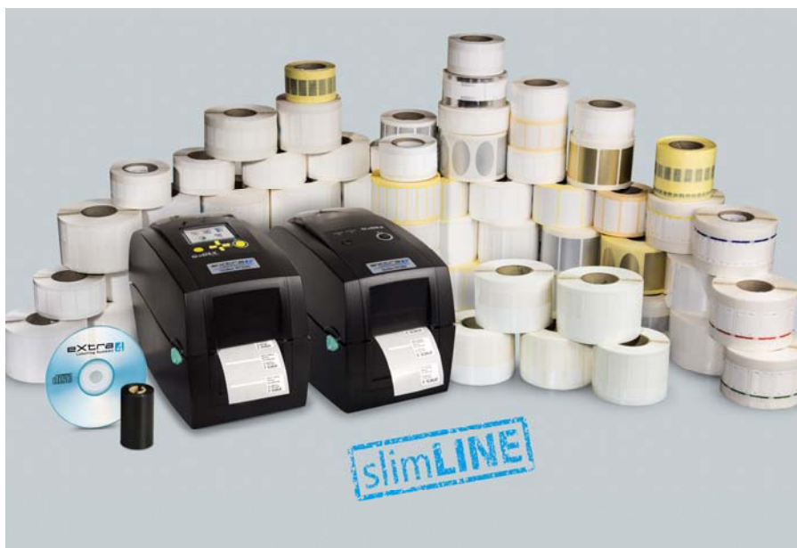
Fig. 2: "slimLINE" product range with label printer Godex RT series, label printing software eXtra4, jewellery labels and colour ink ribbon