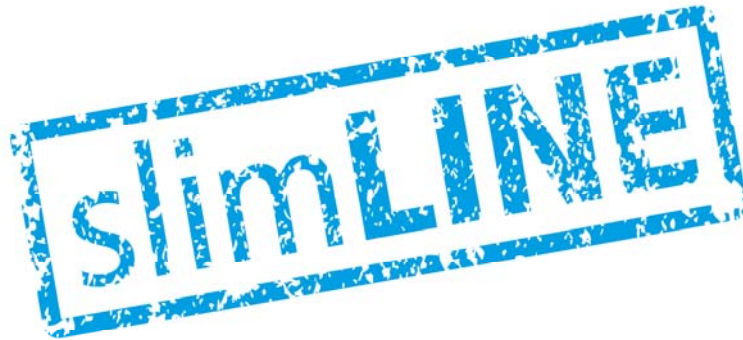
Fig 1: "slimLINE" - favourable label printing for beginners of eXtra4 Labelling Systems