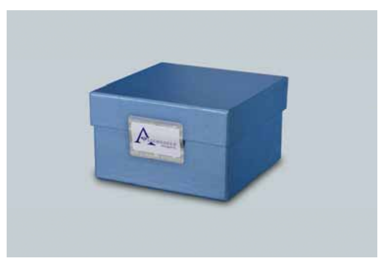
Fig. 1: Security label as a representative manufacturer seal